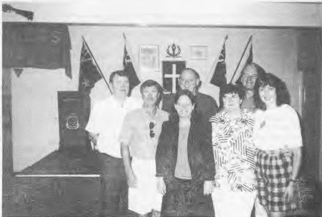
FIRST ANNUAL GENERAL MEETING HELD 31-3-96