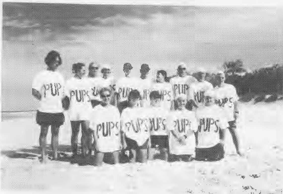
Mudjimba "Pups" who were beaten by the "Old Dogs" at the end of season "Dogs Day" competition — always next year.