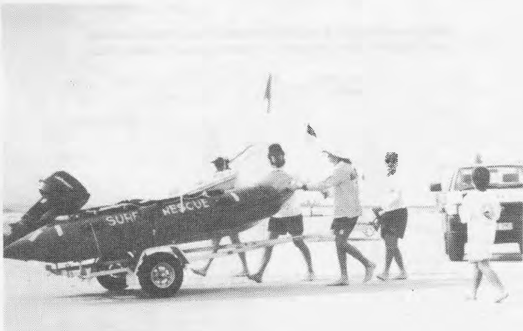
Who forgot the towbar for the vehicle?