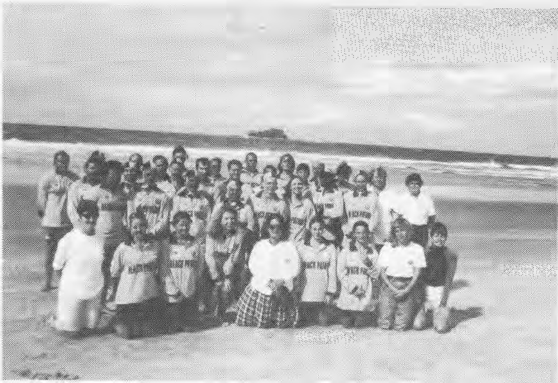
"THE TEAM" Mudjimba Members 1996-1997 Season