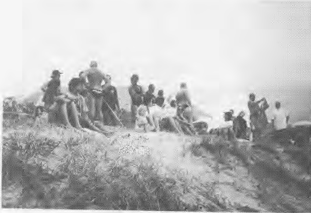
First Competition Team Marcoola Masters Carnival 1996