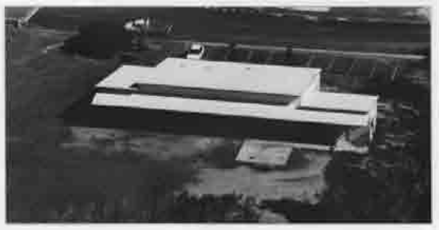
We were at lock-up in time for our Christmas Party in December,