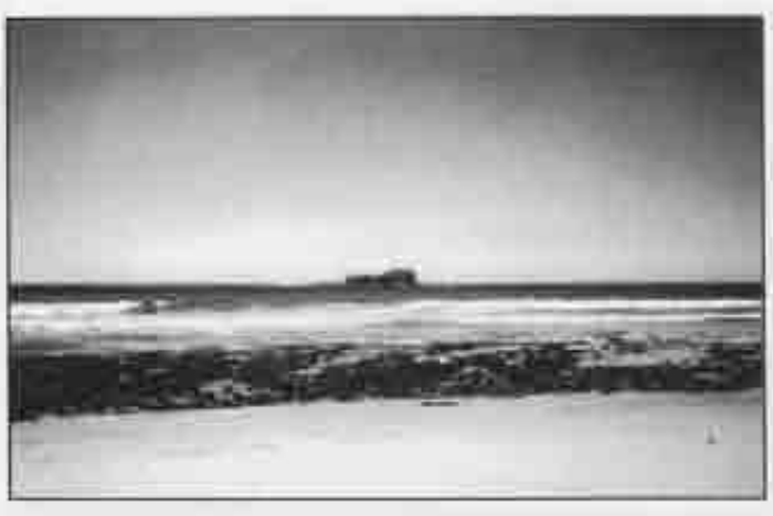
By the end of May Mudjimha Beath was littered once again with coffee rock.

The First Aid Room is almost complete and we are aiming to have the office, toilets and showers complete by the start of the new season. We are still having difficulties with the Department of Natural Resources and the conditions they have imposed on us cut out two major sources of fundraising (food and beverages).