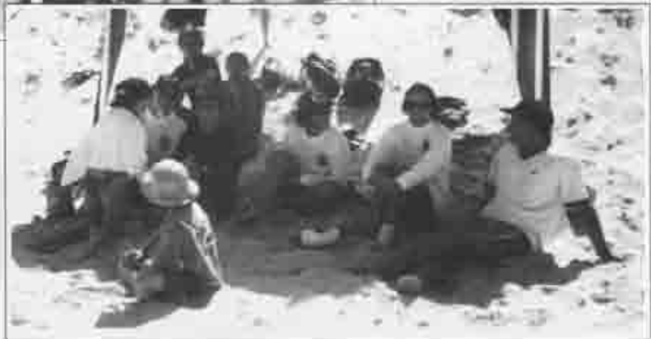
Right - Some thoughtful hosts at one of the carnivals left this tent on the beach - so we used it.