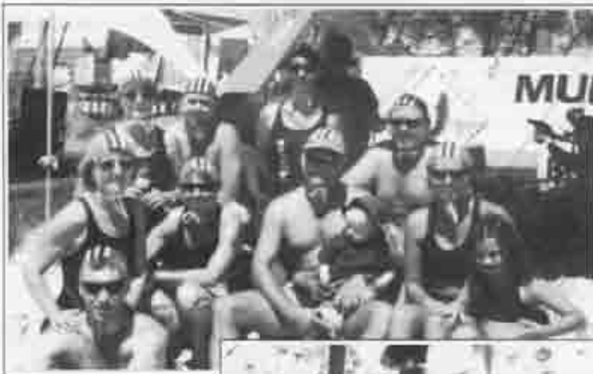
Left - The Marcoola Masters Competition Team with supporters. We could do with a new tent next year!