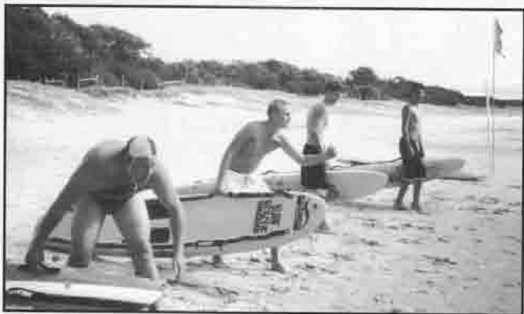
Club Championships 2002