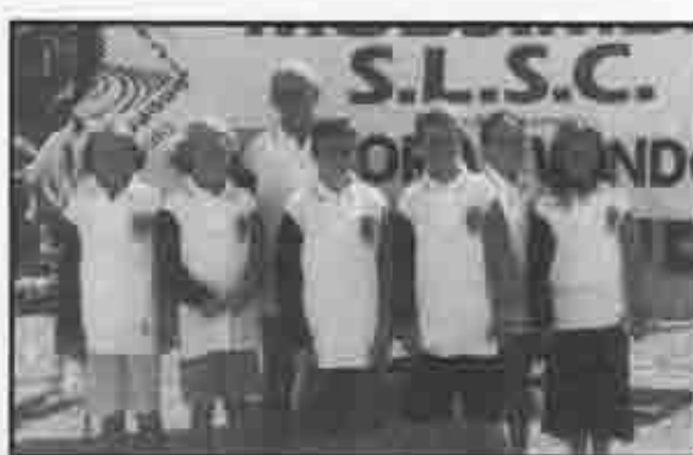
Under 11 Team