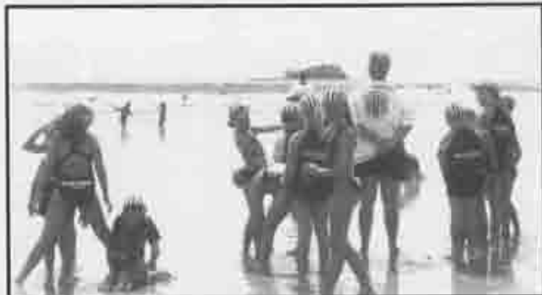
Right - Sunday morning waiting for Water Safety.