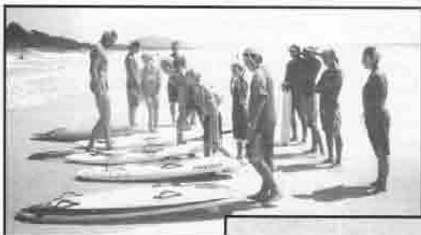
Left - Choosing the right equipment for the best results.