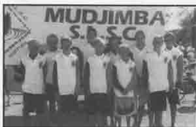
Under 12 Team