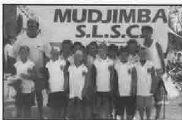
Under 9 Team