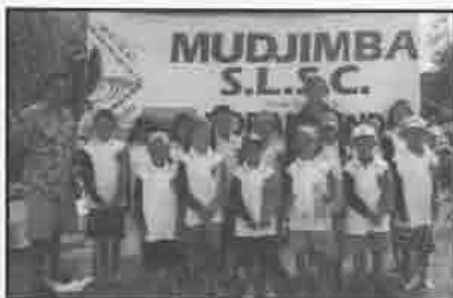
Under 8 Team