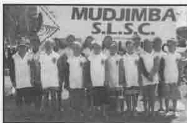
Under 10 Team