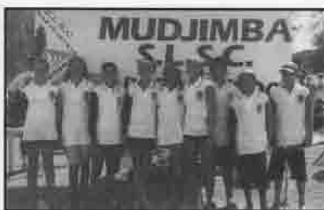
Under 13-14 Team