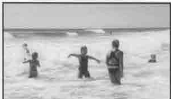
Stuck in the Mud with the Under 8s