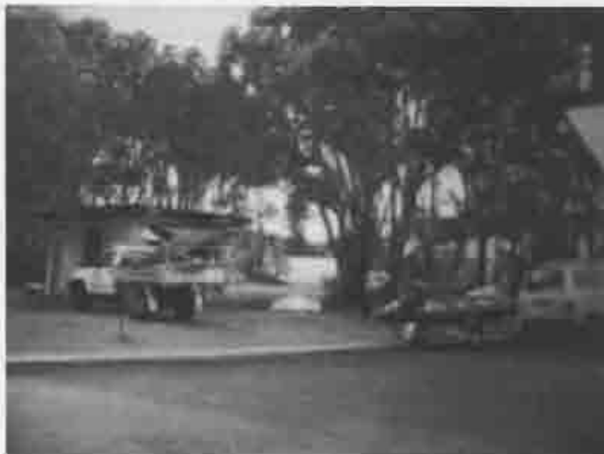
Getting ready for the first patrol at our "Clubhouse" (Old garage on cnr Kawanna St and Mudjimba Beach Rd)

Beach. Twelve years of planning and ten years of Patrols, Mudjimba SLSC has come of age and every person who has had any type of input into the Club can hold their head high and know that they were a part of a very successful Surf Club. The struggle to get where we are now was all worthwhile. There will be challenges in the future for the Club which will be overcome by the dedicated members of the Club. It would be impossible to mention all the people who contributed to the success of Mudjimba SLSC as it would take up most of this Annual Report, we only hope that it is suffice to say thank you. You know who you are, thank you.