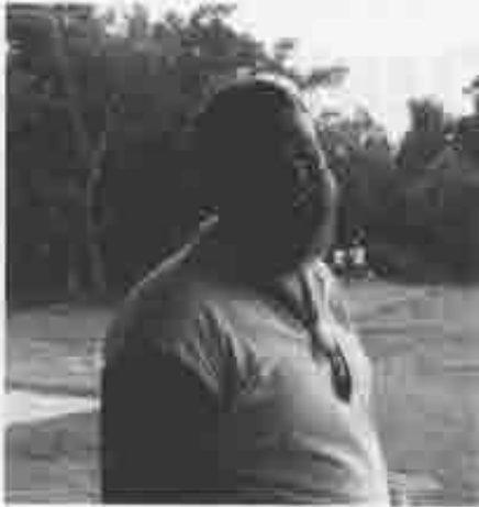
Is this an angelic smile or what!