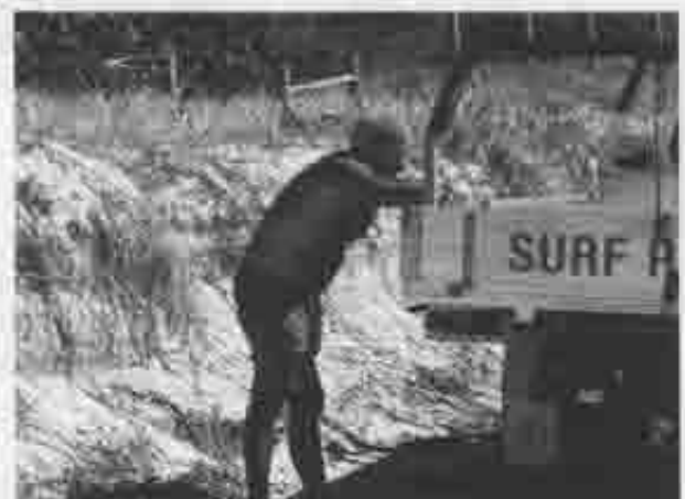
Are you sure that swim was 200 metres?