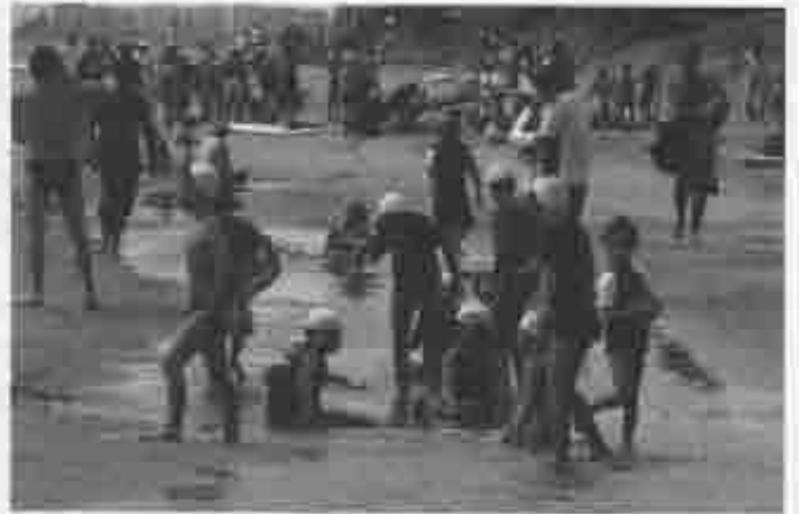
Waiting for the Waves