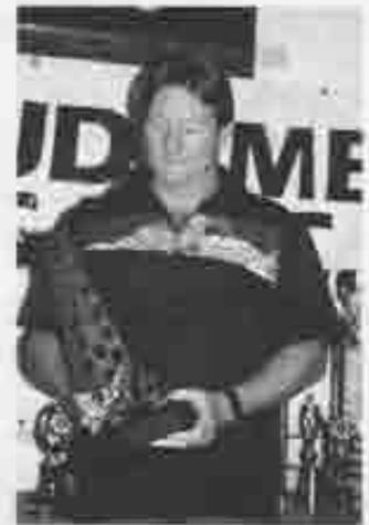
is this a humble look?