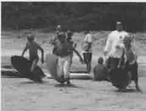
Last one to the Island is a rotten egg!