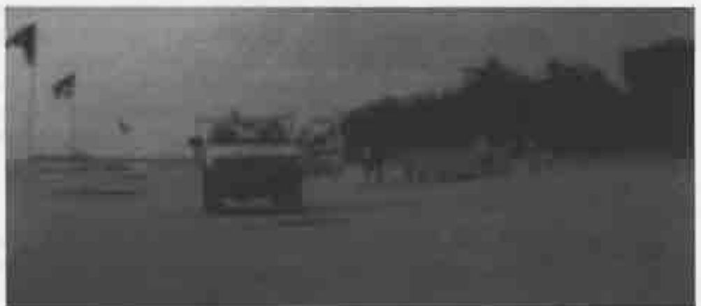
First Patrol at Mudjimba