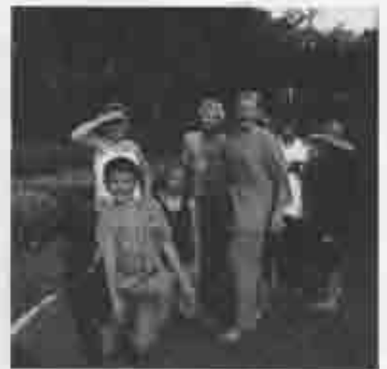
Which way is the beach?