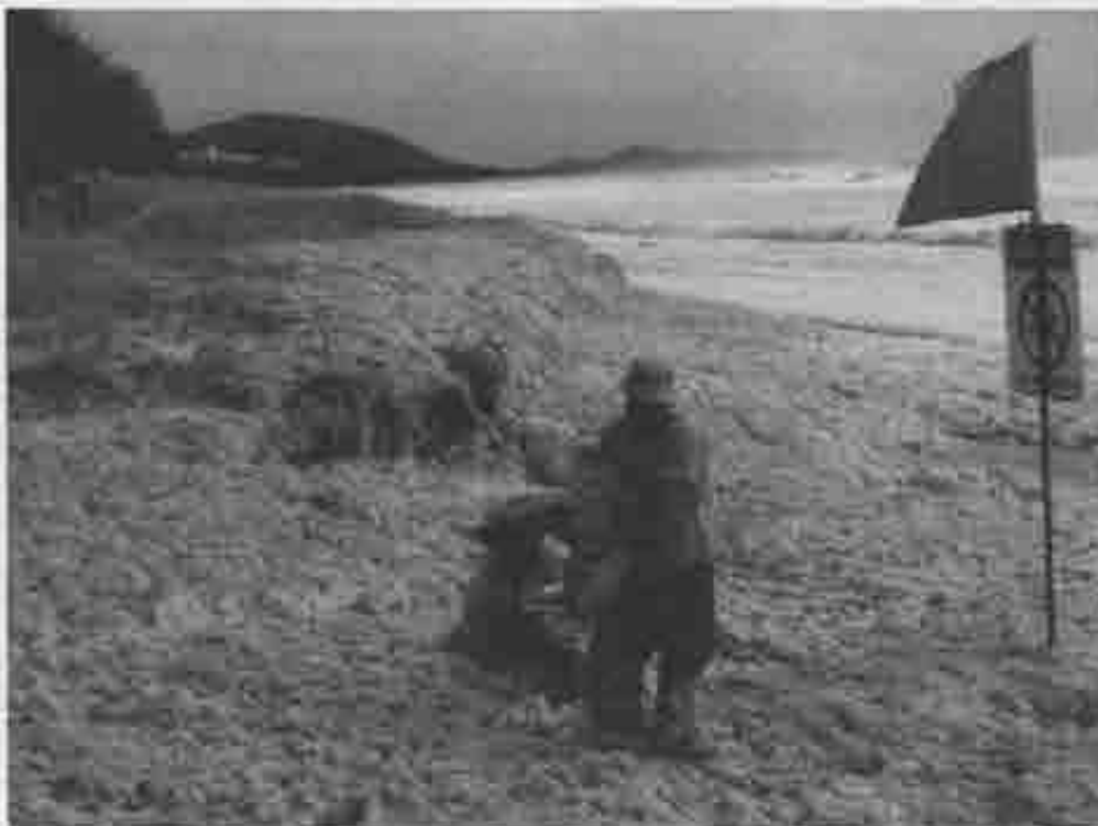
Dog? What Dog?