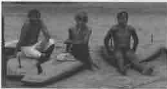
We're sure the boards go this way up.