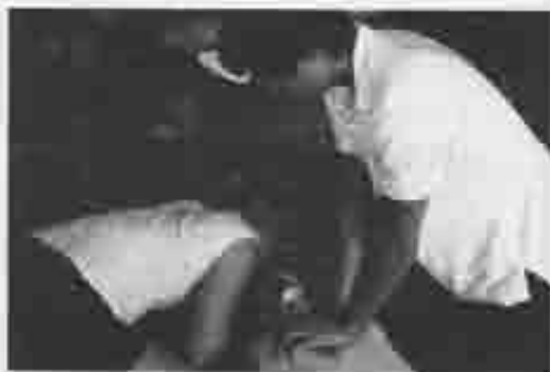
Bronze CPR Assessment