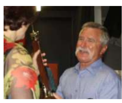
Champion Patrol – 3