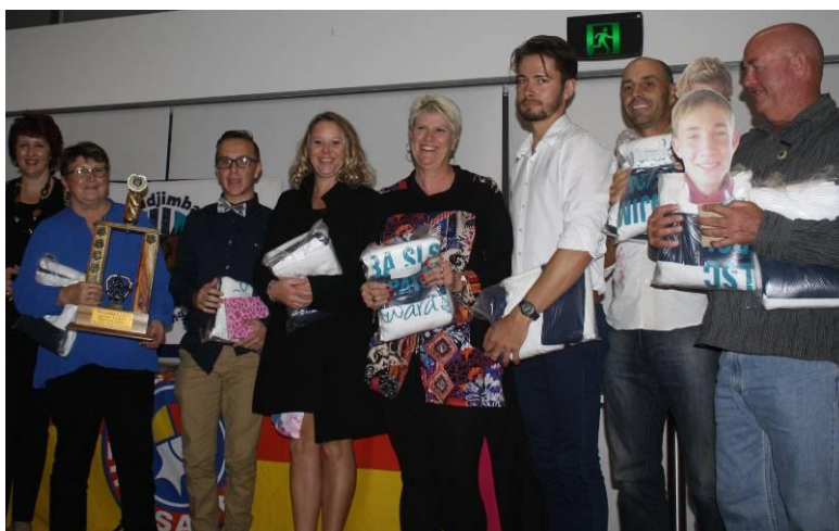
Patrol Spirit Award – Patrol 7