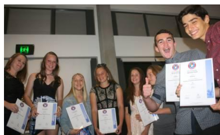
Surf Rescue Certificate Recipients