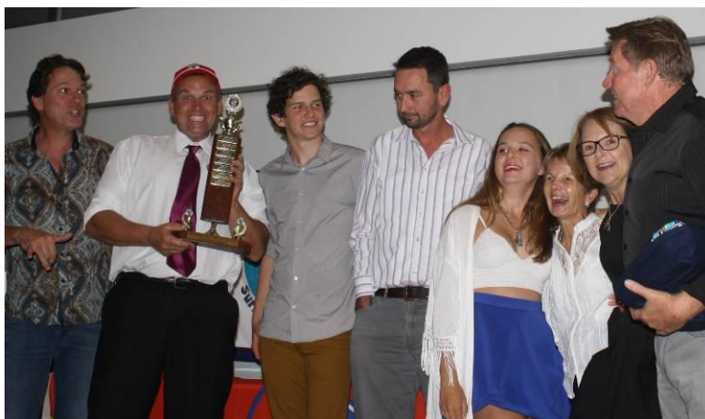
Champion Patrol – Patrol 8