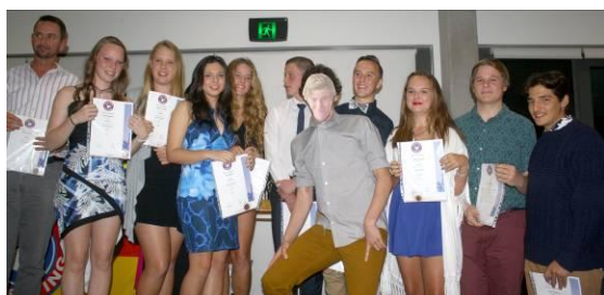
Bronze Medallion Recipients